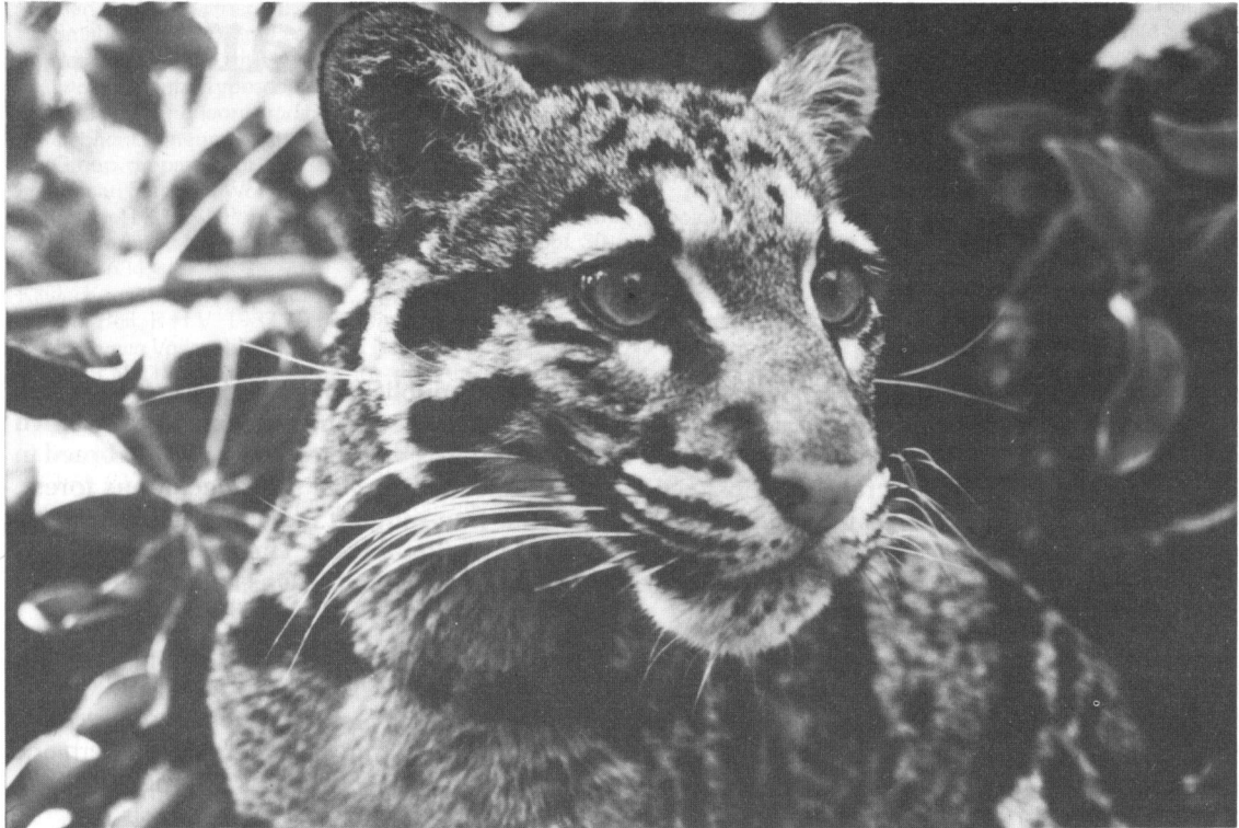
Clouded leopard (Lori Price).

individual, also a male, was stoned to death near the city of Pokhara near the Panchayat Training Centre, retrieved by forestry officials, and placed in the local museum.