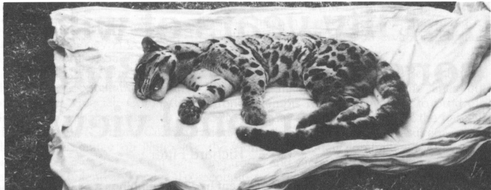
Immobilized clouded leopard.

telemetry work in the central part of Chitwan. Efforts to locate the animal after this were unsuccessful.