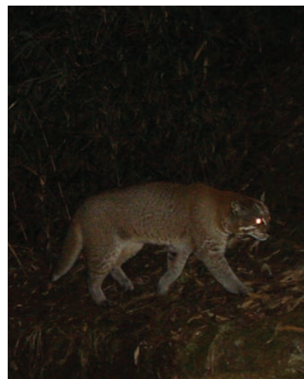
Fig. 1. There are two morphs of the Asiatic golden cat. The ocelot morph (left, Tangjiahe National Nature Reserve, Sichuan, October 2008) appears to be more common in China than the uniform morph (right, Changqing National Nature Reserve, Shaanxi, March 2009).