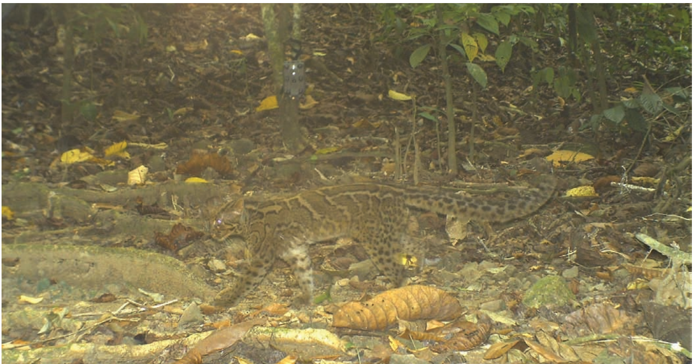
Fig. 1. Camera trap picture taken in the Tabin Wildlife Reserve in Thailand in May 2009.

The marbled cat is thought to be primarily associated with moist and mixed deciduous-evergreen tropical forest (Nowell & Jackson 1996). Collected specimens and skins have come from lowland tropical forest (e.g. Choudhury 1996, Mohd Azlan et al. 2007), but marbled cats also occur in hill forest (Grassman et al. 2005, J. McCarthy pers. comm.). There have also been anecdotal observations in secondary forest, in clearings and logged areas, and in swampy mangroves (Nowell & Jackson 1996). A pair of marbled cats was reported from a salt lick in Thailand's Phu Khieung National Park (Grassman & Tewes 2002).