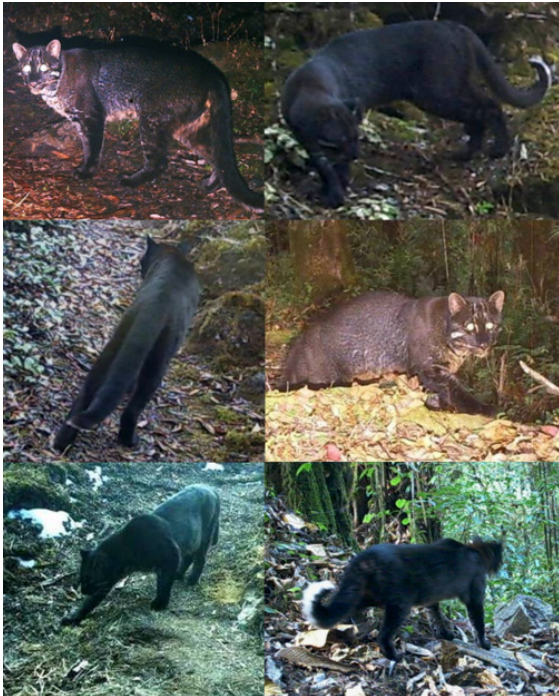
Figure 2. Photo captures of melanistic golden cats from different camera locations in Prek Chu catchment area of Khangchendzonga Biosphere Reserve

non-significant (Kruskal-Wallis Chi square = 4.09, df = 3, p = 0.25).