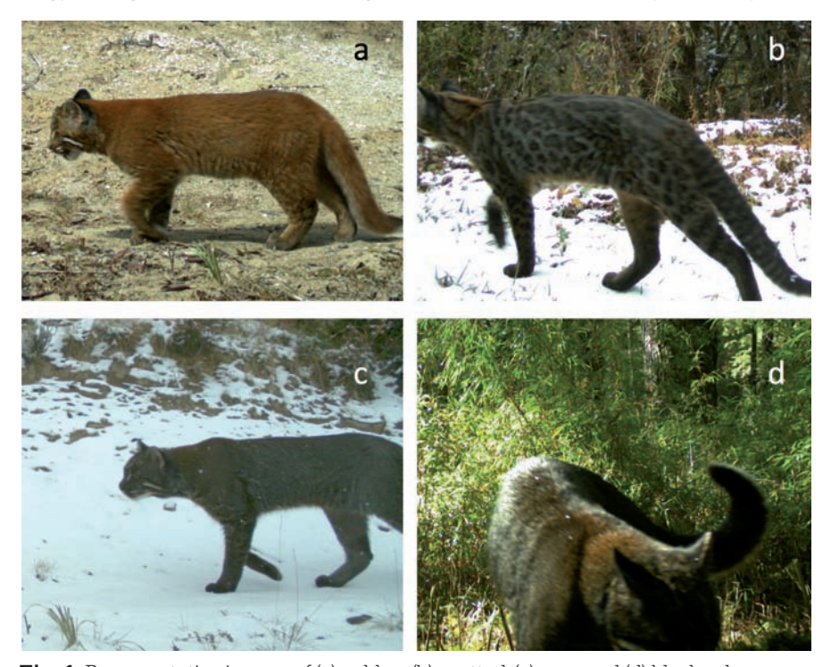
Fig. 1. Representative images of (a) golden, (b) spotted, (c) grey, and (d) black colour morphs of the Asiatic golden cat recorded during a short camera trap survey at Bumthang.

In this note, we describe a brief social interaction between individuals of the spotted and golden colour morphs of the Asiatic golden cat, and report on the co-occurrence of the four known colour morphs of the species