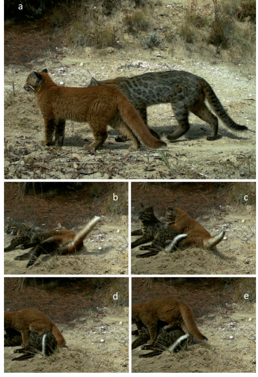
Fig. 2. Sequence of camera trap photos of a golden morph and a spotted morph of the Asiatic golden cat recorded during a camera trap survey at Bumthang, Bhutan.

Camera trapping is revealing much about the occurrence of Asiatic golden cats, with