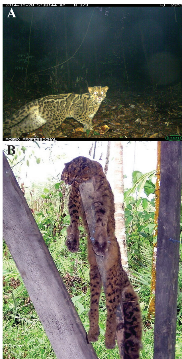
Fig. 1. A, marbled cat Pardofelis marmorata camera-trapped in Deramakot Forest Reserve, Sabah Malaysia on 28 October 2014; B, marbled cat hunted in eastern Sarawak for its meat and pelt.

Historical and recent records indicate that marbled cat is a rare species, and therefore little is known about population