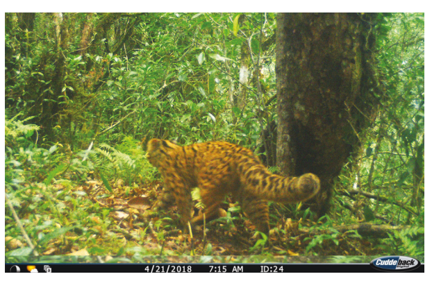
Image 2. Camera trap image of the Marbled Cat Pardofelis marmorata from Khuzama Village from Nagaland, India.