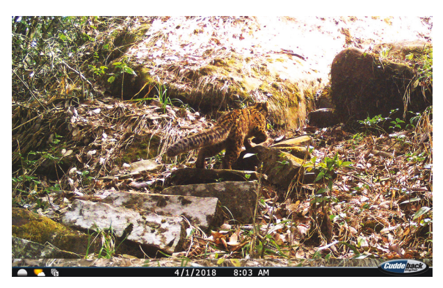
Image 1. Camera trap image of the Marbled Cat Pardofelis marmorata from Benreu Village in Nagaland, India.