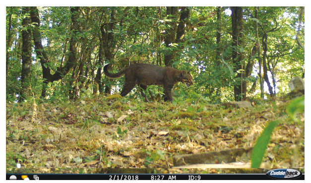
Image 4. Camera trap image of the Asiatic Golden Cat Catopuma temminckii from Jotsoma Village in Nagaland, India.

Multiple villages in the landscape have realized the importance of protecting their forests and have initiated their own efforts to conserve them. These efforts vary among villages. In some villages, the village council, an apex governing body for the village, has issued complete or seasonal bans on hunting. In some cases, resource extraction from the forests for commercial purposes is regulated by the council. Sections of the village-owned forest in Khonoma, Dzüleke, Benreu, and other villages