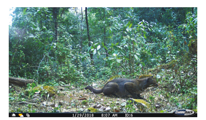
Image 3. Camera trap image of the Asiatic Golden Cat Catopuma temminckii from Jotsoma Village in Nagaland, India.

felid presence in northeastern India, particularly in the community-owned forests of the region.