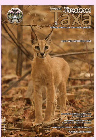
SMALL WILD CATS SPECIAL ISSUE

DOI: 10.11609/jott.6504.12.16.17229-17234