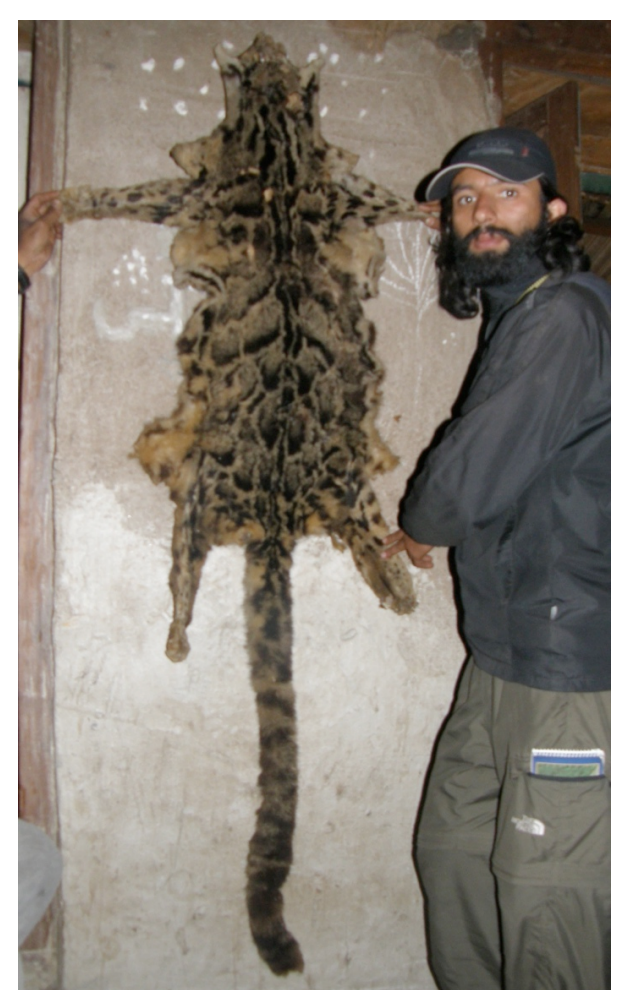
Image 1. Clouded Leopard skin found in December 2009 in Sankhuwasabha District.

Other aspects of this trade like origin, price range of pelts and body parts and people involved in the trade are equally important to understand the dynamics of this trade. Hence, we strongly recommend to keep track of trade related records of Clouded Leopard to understand the trend of this trade, possible trade routes and destinations in order to guide strategic enforcement efforts on the species in the future. Further concerted effort on status survey of the species is also essential.